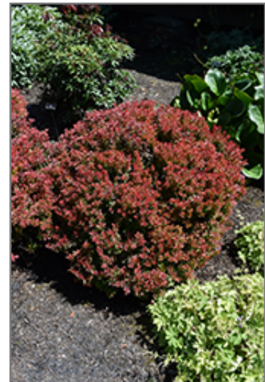
Golden Ruby Barberry