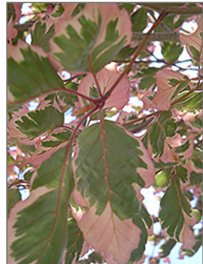
Tricolor Beech foliage