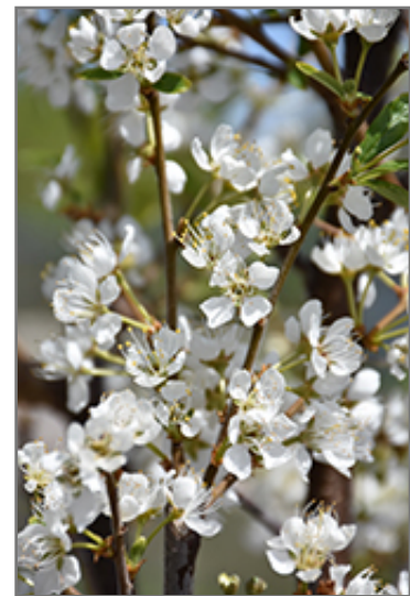
Toka Plum flowers