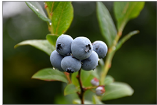
Northsky Blueberry fruit

Northsky Blueberry features dainty clusters of white bell-shaped flowers with shell pink overtones hanging below the branches in mid spring. It has green deciduous foliage. The glossy oval leaves turn an outstanding scarlet in the fall. It features an abundance of magnificent blue berries in mid summer.