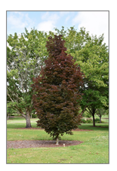
Crimson Sentry Norway Maple