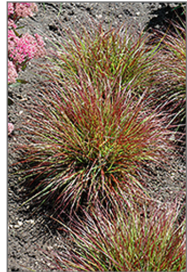
Burgundy Bunny Dwarf Fountain Grass