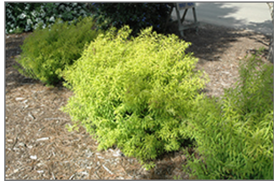
Mellow Yellow Spirea

Mellow Yellow Spirea is recommended for the following landscape applications;