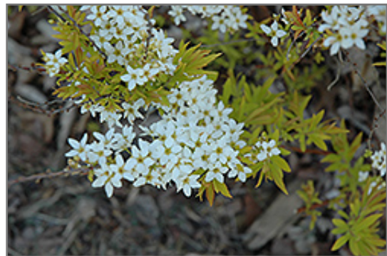
Mellow Yellow Spirea flowers