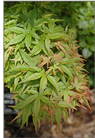
Sharp's Pygmy Japanese Maple foliage