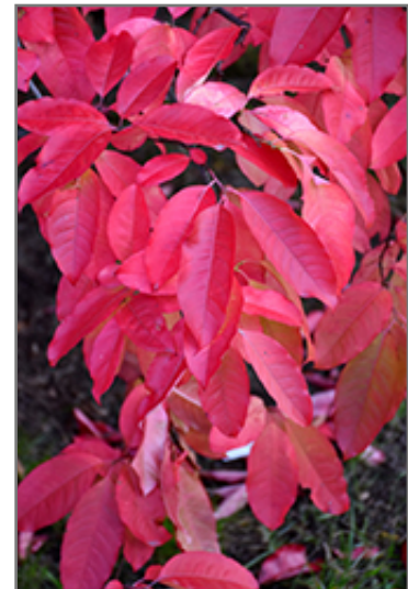
Sourwood in fall