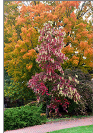
Sourwood in fall

This tree does best in full sun to partial shade. It does best in average to evenly moist conditions, but will not tolerate standing water. It is very fussy about its soil conditions and must have rich, acidic soils to ensure success, and is subject to chlorosis (yellowing) of the foliage in alkaline soils. It is quite intolerant of urban pollution, therefore inner city or urban streetside plantings are best avoided, and will benefit from being planted in a relatively sheltered location. Consider applying a thick mulch around the root zone in winter to protect it in exposed locations or colder microclimates. This species is native to parts of North America, and parts of it are known to be toxic to humans and animals, so care should be exercised in planting it around children and pets.