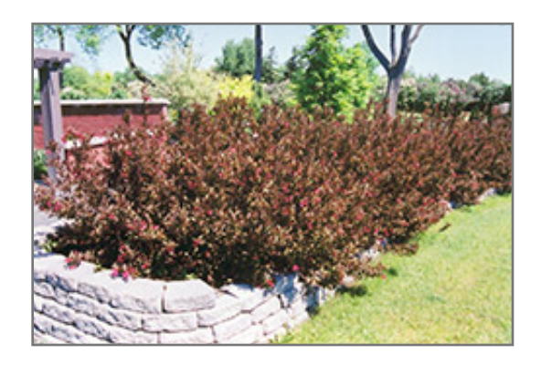
Wine and Roses Weigela