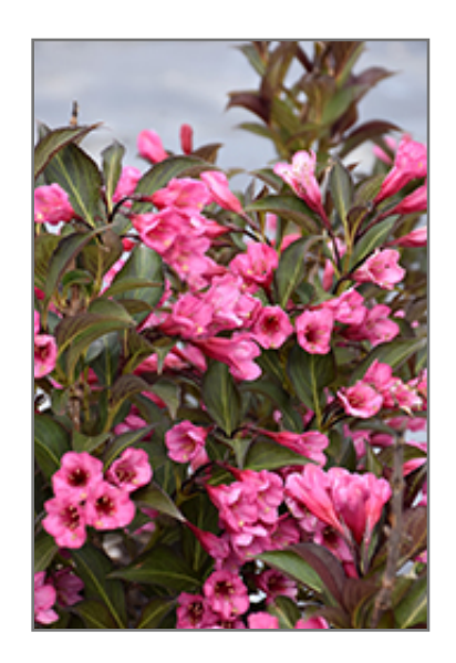
Wine and Roses Weigela flowers