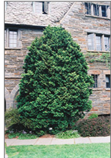
Compact Hinoki Falsecypress

Compact Hinoki Falsecypress will grow to be about 20 feet tall at maturity, with a spread of 15 feet. It has a low canopy with a typical clearance of 2 feet from the ground, and is suitable for planting under power lines. It grows at a slow rate, and under ideal conditions can be expected to live for 70 years or more.