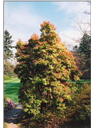
Valley Fire Japanese Pieris

* This is a 'special order' plant - contact store for details