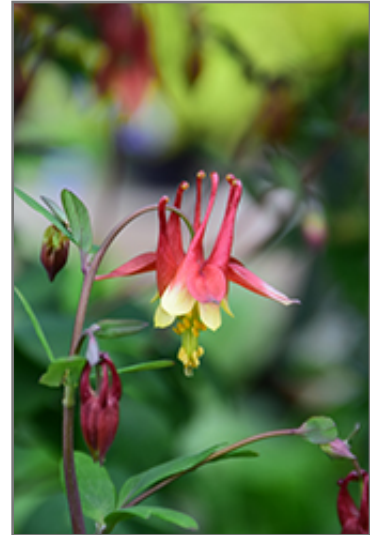
Wild Red Columbine flowers

Wild Red Columbine is recommended for the following landscape applications;