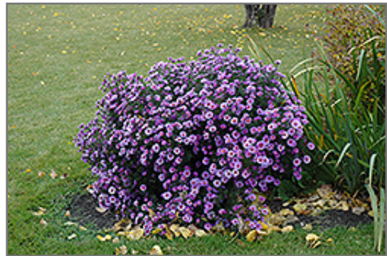
Purple Dome Aster in bloom