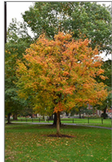
Three Flowered Maple in fall