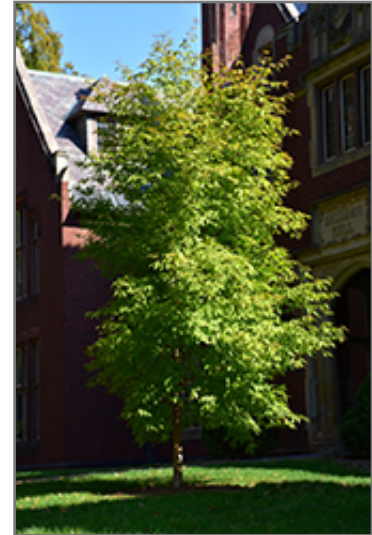
Three Flowered Maple