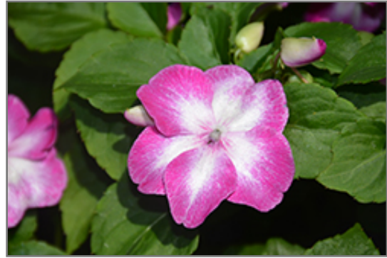
Super Elfin XP Violet Starburst Impatiens flowers

Super Elfin XP Violet Starburst Impatiens is recommended for the following landscape applications;