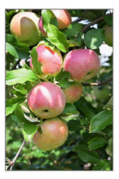
Northern Spy Apple fruit

Columbus Garden Center - 1156 Oakland Park Avenue, Columbus, OH 43224-3317 Phone: 614-268-3511 Fax: 614-784-7700 Delaware Garden Center - 25 Kilbourne Road, Delaware, OH 43015 Phone: 740-548-6633 Fax: 740-363-2091 Dublin Garden Center - 4261 West Dublin-Granville Road, Dublin, Ohio 43017 Phone: 614-874-2400 Fax: 614-874-2420 New Albany Garden Center - 5211 Johnstown Rd, New Albany, Ohio 43054 Phone: 614-917-1020 Fax: 614-917-1023