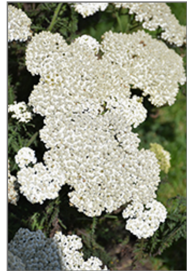
Firefly Diamond Yarrow flowers

Firefly Diamond Yarrow is recommended for the following landscape applications;