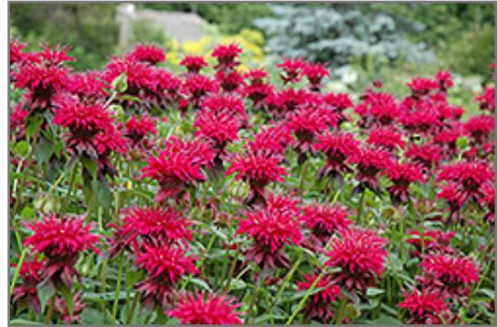
Raspberry Wine Beebalm flowers