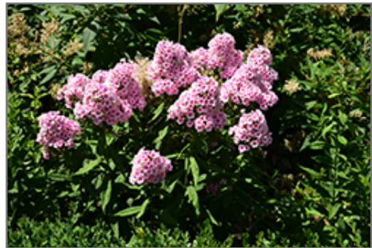
Bright Eyes Garden Phlox in bloom