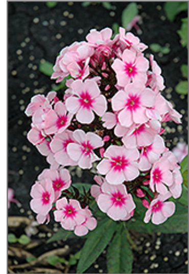
Bright Eyes Garden Phlox flowers

Bright Eyes Garden Phlox is a fine choice for the garden, but it is also a good selection for planting in outdoor pots and containers. With its upright habit of growth, it is best suited for use as a 'thriller' in the 'spiller-thriller-filler' container combination; plant it near the center of the pot, surrounded by smaller plants and those that spill over the edges. It is even sizeable enough that it can be grown alone in a suitable container. Note that when growing plants in outdoor containers and baskets, they may require more frequent waterings than they would in the yard or garden.