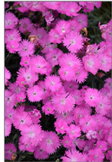
Firewitch Pinks flowers

Firewitch Pinks is recommended for the following landscape applications;