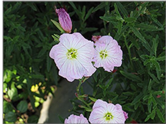
Evening Primrose flowers