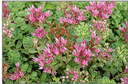
John Creech Stonecrop flowers

John Creech Stonecrop is recommended for the following landscape applications;