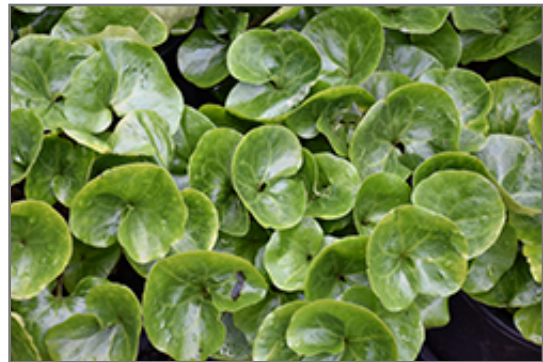
European Wild Ginger foliage