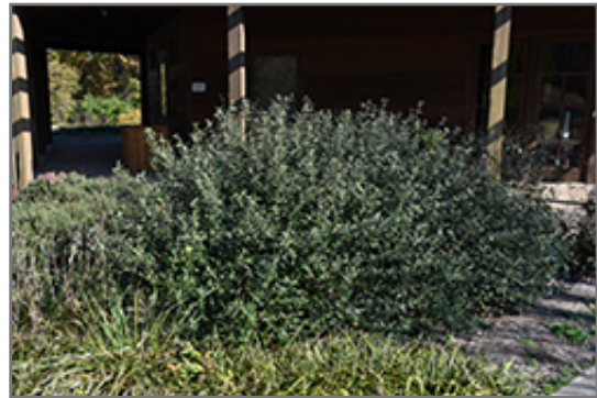
Prague Viburnum