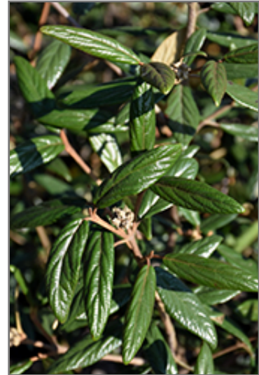
Prague Viburnum foliage

This shrub does best in full sun to partial shade. It prefers to grow in average to moist conditions, and shouldn't be allowed to dry out. It is not particular as to soil type or pH. It is highly tolerant of urban pollution and will even thrive in inner city environments. This particular variety is an interspecific hybrid.