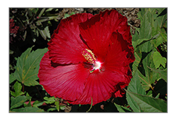
Cordial Cinnamon Grappa Hibiscus flowers