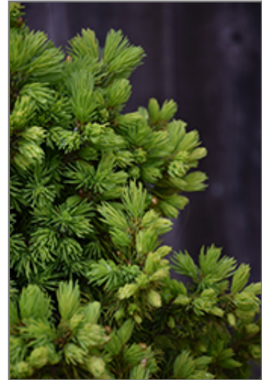
Rainbow's End Spruce foliage

This shrub should only be grown in full sunlight. It prefers to grow in average to moist conditions, and shouldn't be allowed to dry out. It is not particular as to soil type or pH. It is somewhat tolerant of urban pollution, and will benefit from being planted in a relatively sheltered location. This is a selection of a native North American species.