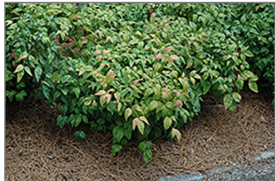
Fire Power Nandina