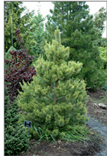
Gold Coin Scotch Pine

This is a relatively low maintenance tree. When pruning is necessary, it is recommended to only trim back the new growth of the current season, other than to remove any dieback. Deer don't particularly care for this plant and will usually leave it alone in favor of tastier treats. It has no significant negative characteristics.