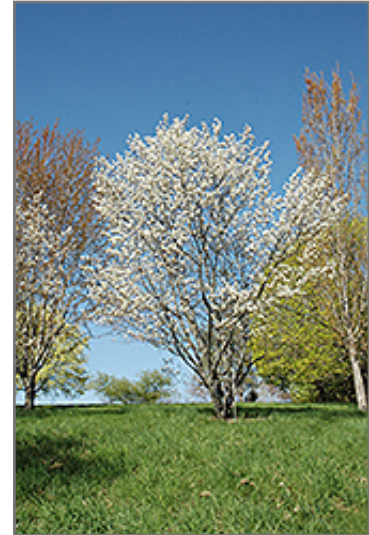
Princess Diana Serviceberry in bloom