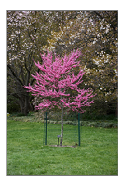
Appalachian Red Redbud in bloom