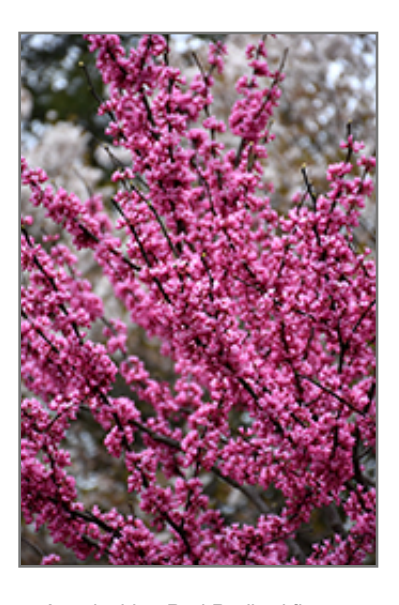
Appalachian Red Redbud flowers