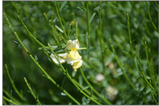
Moonlight Scotch Broom flowers

This shrub should only be grown in full sunlight. It prefers dry to average moisture levels with very well-drained soil, and will often die in standing water. It is considered to be drought-tolerant, and thus makes an ideal choice for xeriscaping or the moisture-conserving landscape. It is particular about its soil conditions, with a strong preference for clay, alkaline soils, and is able to handle environmental salt. It is highly tolerant of urban pollution and will even thrive in inner city environments. This is a selected variety of a species not originally from North America.