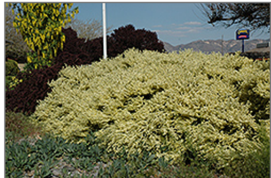
Moonlight Scotch Broom in bloom