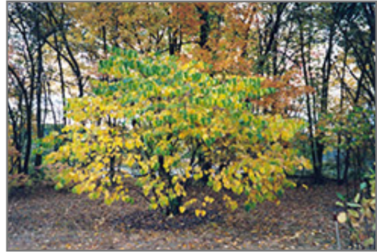
Northern Strain Redbud in fall

This tree does best in full sun to partial shade. It prefers to grow in average to moist conditions, and shouldn't be allowed to dry out. It is not particular as to soil type or pH. It is highly tolerant of urban pollution and will even thrive in inner city environments, and will benefit from being planted in a relatively sheltered location. Consider applying a thick mulch around the root zone in winter to protect it in exposed locations or colder microclimates. This is a selection of a native North American species.