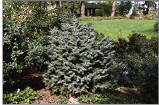
Papoose Dwarf Sitka Spruce