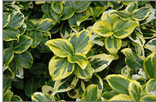
Gold Prince Wintercreeper foliage