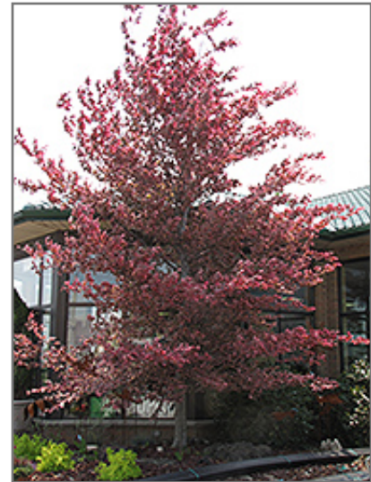
Tricolor Beech