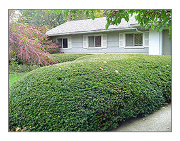
Ward's Yew

This shrub performs well in both full sun and full shade. However, you may want to keep it away from hot, dry locations that receive direct afternoon sun or which get reflected sunlight, such as against the south side of a white wall. It does best in average to evenly moist conditions, but will not tolerate standing water. It is not particular as to soil type or pH. It is highly tolerant of urban pollution and will even thrive in inner city environments, and will benefit from being planted in a relatively sheltered location. Consider applying a thick mulch around the root zone in winter to protect it in exposed locations or colder microclimates. This particular variety is an interspecific hybrid, and parts of it are known to be toxic to humans and animals, so care should be exercised in planting it around children and pets.