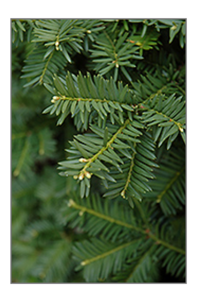
Ward's Yew foliage