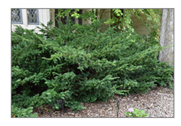
Ward's Yew