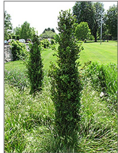
Graham Blandy Boxwood