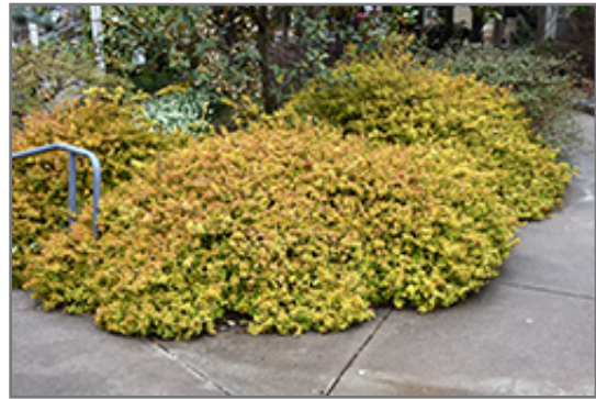
Kaleidoscope Abelia

Kaleidoscope Abelia will grow to be about 30 inches tall at maturity, with a spread of 4 feet. It tends to fill out right to the ground and therefore doesn't necessarily require facer plants in front. It grows at a slow rate, and under ideal conditions can be expected to live for approximately 30 years.