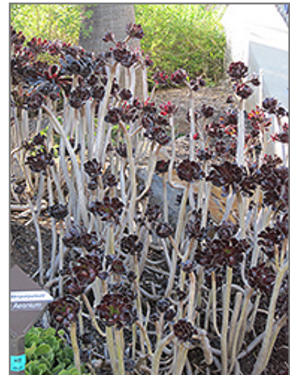
Purple Aeonium