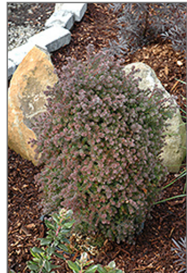
Red Star Whitecedar