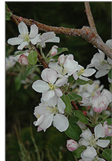
Pink Lady Apple flowers