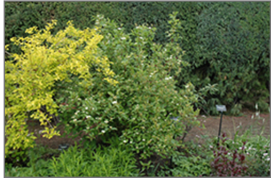
Red Osier Dogwood

This shrub does best in full sun to partial shade. It is an amazingly adaptable plant, tolerating both dry conditions and even some standing water. It is not particular as to soil type or pH. It is highly tolerant of urban pollution and will even thrive in inner city environments. This species is native to parts of North America.