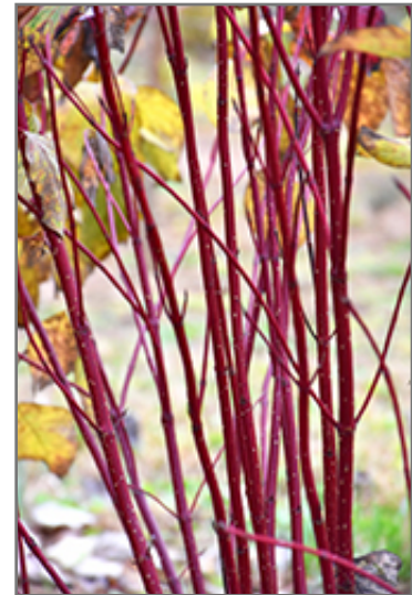
Red Osier Dogwood stems

Red Osier Dogwood is recommended for the following landscape applications;