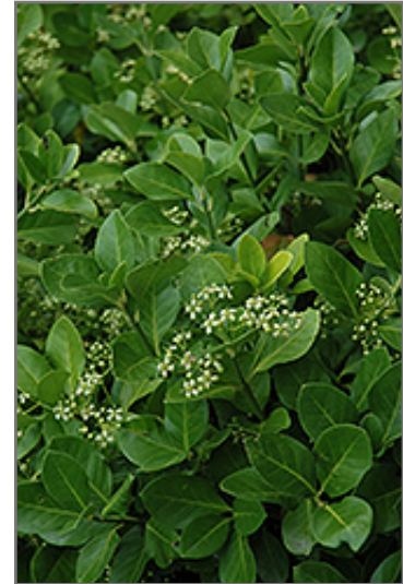
Manhattan Spreading Euonymus flowers

This shrub performs well in both full sun and full shade. It is very adaptable to both dry and moist locations, and should do just fine under average home landscape conditions. It is not particular as to soil type or pH. It is highly tolerant of urban pollution and will even thrive in inner city environments, and will benefit from being planted in a relatively sheltered location. This is a selected variety of a species not originally from North America.