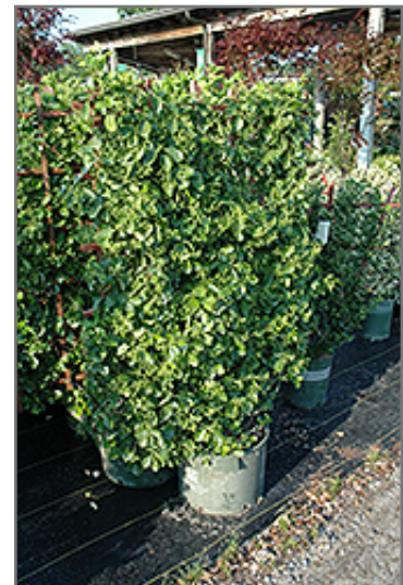
Manhattan Spreading Euonymus