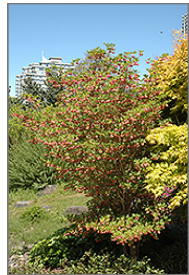
Redvein Enkianthus in bloom