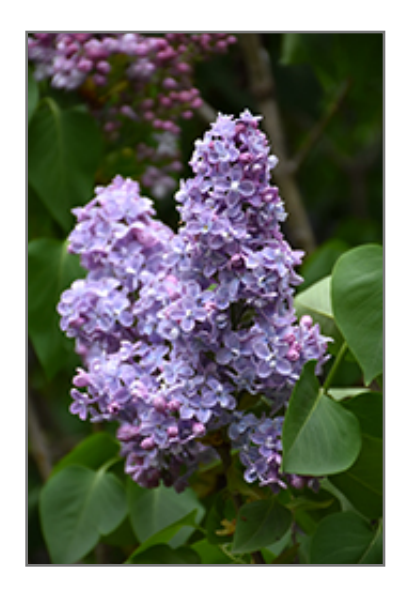
President Grevy Lilac flowers

This classic spring blooming French hybrid features exquisitely scented double blue flowers in upright panicles; upright, multi-stemmed habit, very hardy, tends to sucker, ideal for screening; full sun and well-drained soil, allow room for air movement