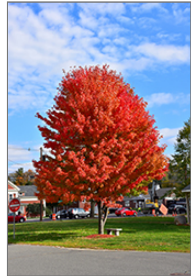
Autumn Splendor Sugar Maple in fall