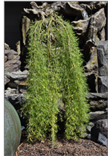
Walker Weeping Peashrub

Walker Weeping Peashrub is ideal for use as a garden accent or patio feature, and is recommended for the following landscape applications;