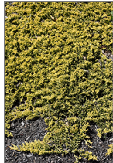
Mother Lode Juniper foliage