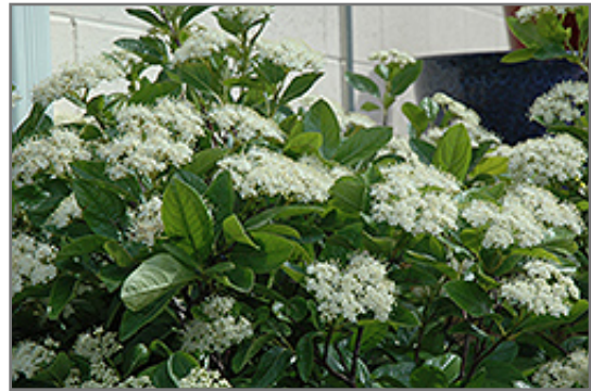
Winterthur Viburnum flowers

This is a relatively low maintenance shrub, and should only be pruned after flowering to avoid removing any of the current season's flowers. It is a good choice for attracting birds to your yard, but is not particularly attractive to deer who tend to leave it alone in favor of tastier treats. It has no significant negative characteristics.