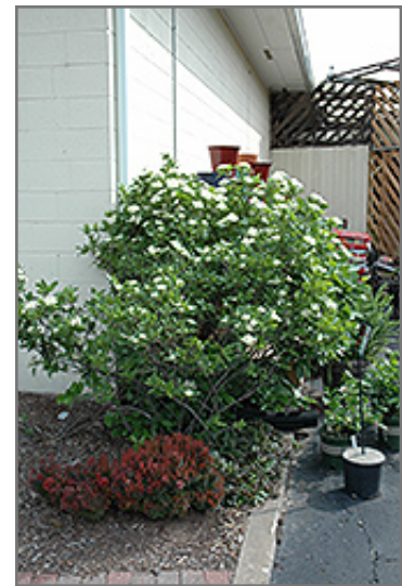
Winterthur Viburnum in bloom